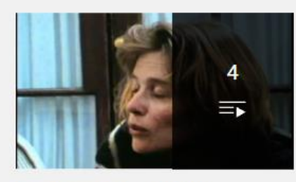
Fundamentals of DMT HELE PLAYLIST BEKIJKEN