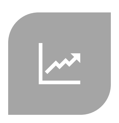
NEXT YEAR WE WILL FOCUS ON WHAT TO DO AND WHEN IN ORDER TO EXPAND THE EADMT IMPACT.